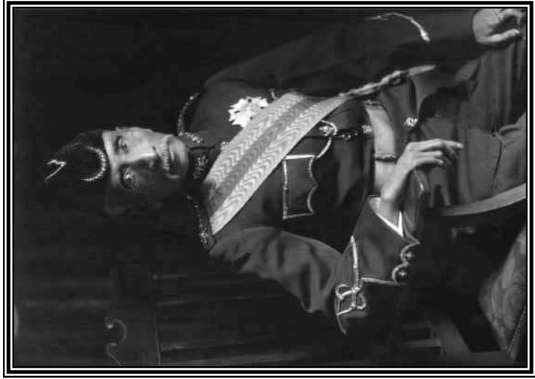
(7) Sultan Idris of Perak (1849-1916)