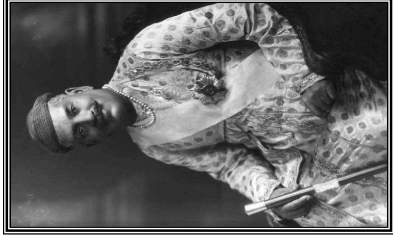
(2) Maharaja Sir Sayajirao III Gaekwad of Baroda (1863-1939)