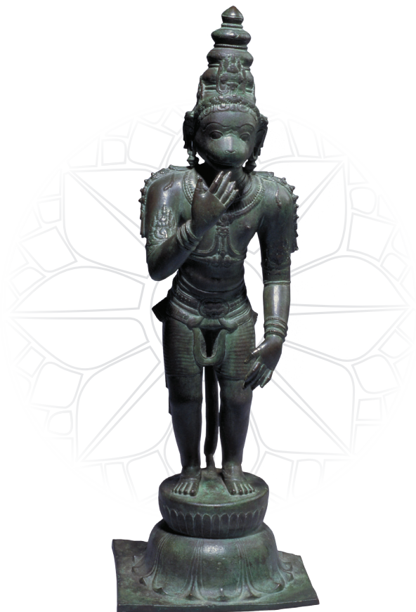
Hanuman | India, Tamil Nadu, Late Chola period, around 1200. Bronze