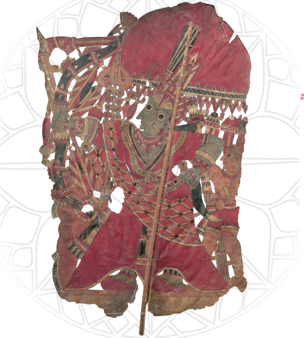
Shri Rama | India, Karnataka, 19th century. Leather