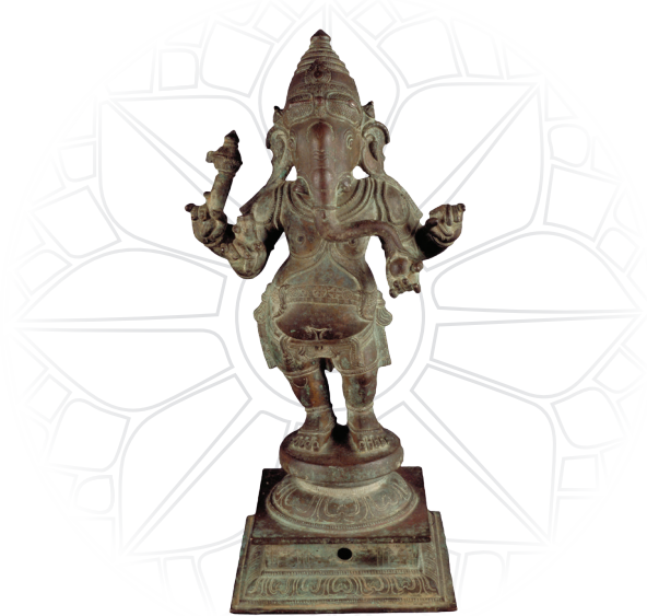
Ganesha | India, Tamil Nadu, 18th or 19th century. Bronze