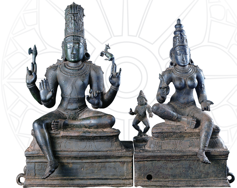
Somaskanda | India, Tamil Nadu, around 12th century (late Chola period). Bronze

LOOK closely at his face and his posture. CIRCLE the words that you think describe him best.